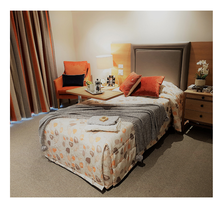
Extra Large Single Room Cost $580,000