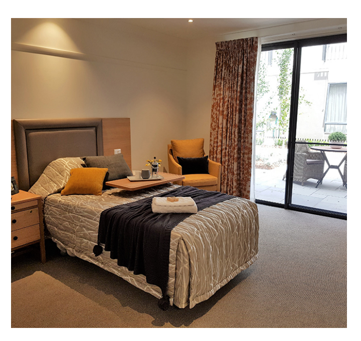
Large Single Room Cost