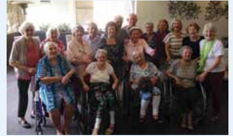
Resident's at The Terraces have been enjoying fun-packed 'Brain Gym' sessions.