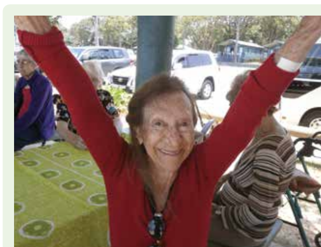
Staff at SandBrook have enjoyed planning lots of picnics and BBQs over the summer and residents especially loved the day out at Jacobs Well north of the Gold Coast.