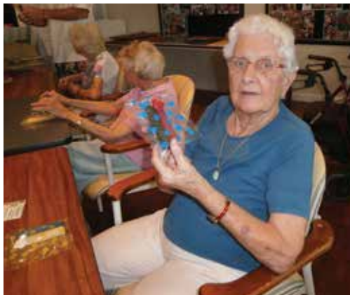
SandBrook residents enjoyed the morning they spent making candles. Even those with very limited sight were able to achieve the desired finished product.