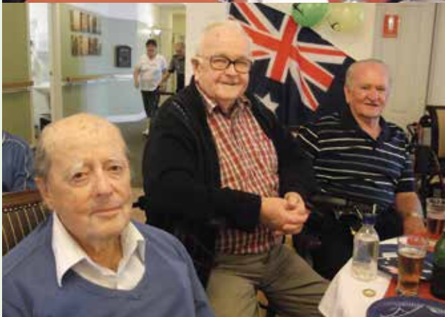
Newmans on the Park residents enjoyed Australia Day with a BBQ in the garden, entertainers singing Aussie classics and of course, some Aussie tucker.