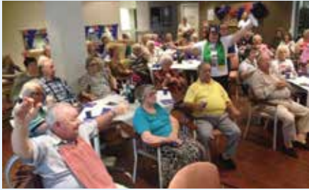
Terraces' residents and staff enjoying Australia Theme Day together.