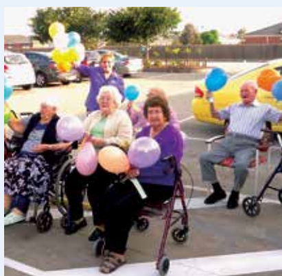
Sutton Park residents and staff spent New Years Eve thinking about their wishes and dreams for the year. They tied them to balloons and let them go outside, sending their wishes for 2015 into the sky.